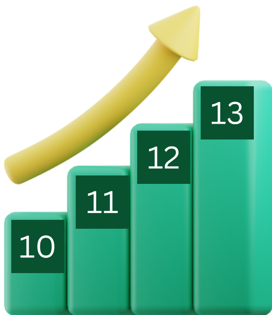
Ascending : 10, 11, 12, 13